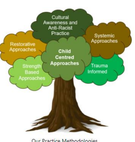
Our Practice Methodologies